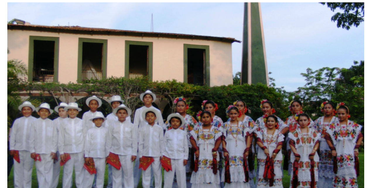
Yidzat il kay Choir - Yucatán, Mexico