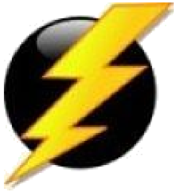
Lake Forest Elementary.